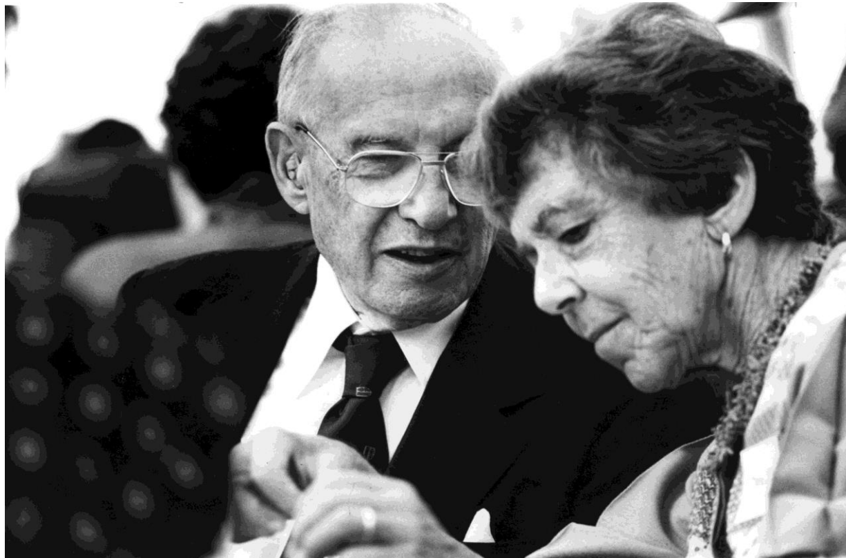
Peter F. Drucker 1909-2005