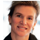
Mariana Mazzucato Professor University of Sussex