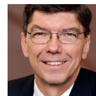
Clayton Christensen Professor, Harvard Business School