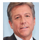
Bill McDermott CEO SAP (TBC)