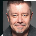
Tim Brown CEO Ideo