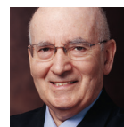
Philip Kotler Distinguished Professor, Kellogg School of Management