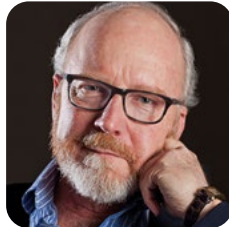
John Hagel III founder of the Deloitte Center for the Edge